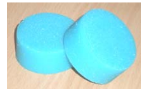
Easy-to-handle, 30 gram Chela Blue Tab