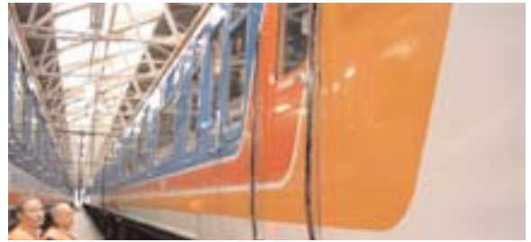
Train after cleaning with Eurowash XL. Notice how clean and clear the paint is.

A copy of the full report is available on request.