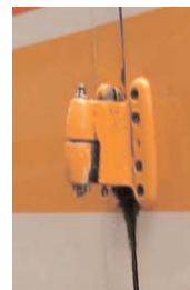
Close up of hinge after cleaning with Eurowash XL